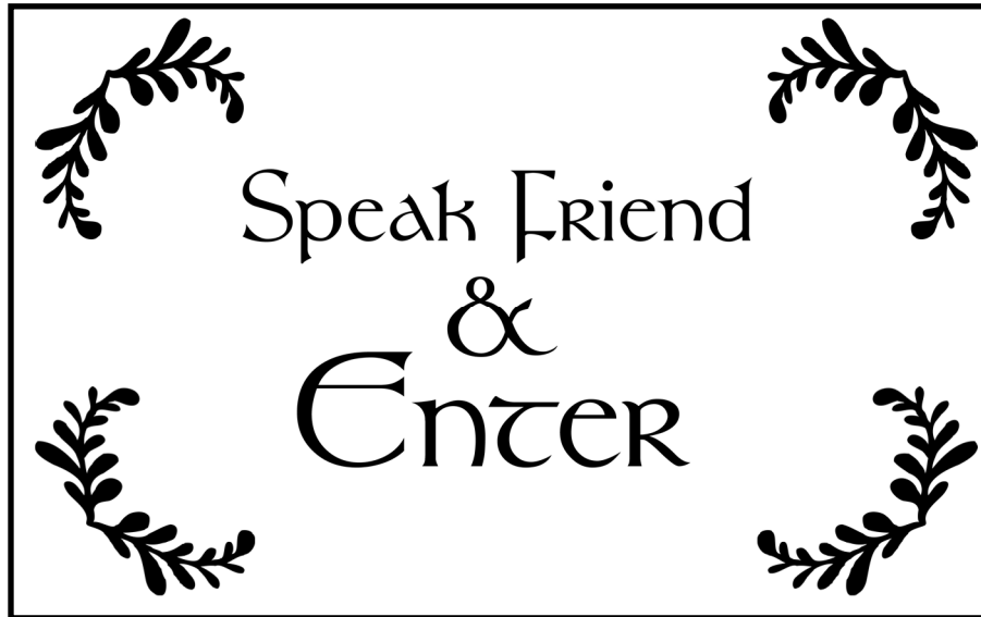
DOOR MAT LAYOUT

Print the patterns then cut them in sections and place them on contact paper and cut it out using an X-acto knife. (You can of course also use cardstock and tape them in place for stenciling or use the Silhouette pattern included in the post.) These are made to fit a mat that is approximately 24" x19" though the size does not have to be accurate.